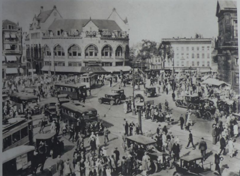
Proliferation of Urban Mobility – Hofplein, Rotterdam (1929)